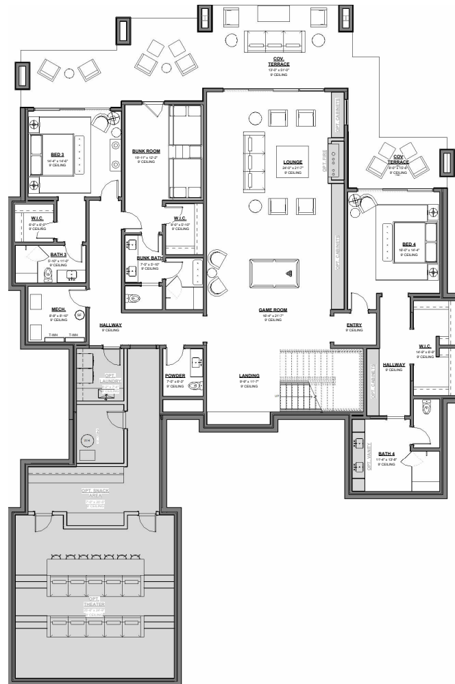
LOWER LEVEL FLOOR PLAN – OPTIONAL

6,673 Square Feet (with options) | 5 En Suite Bedrooms | 5 Full Baths | 2 Half Baths | 3-Car Garage