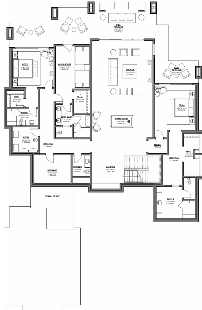
LOWER LEVEL FLOOR PLAN – STANDARD

5,745 Square Feet | 5 En Suite Bedrooms | 5 Full Baths | 2 Half Baths | 2-Car Garage