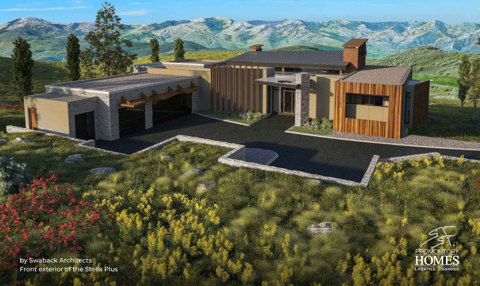
by Swaback Architects Front exterior of the Stella Plus