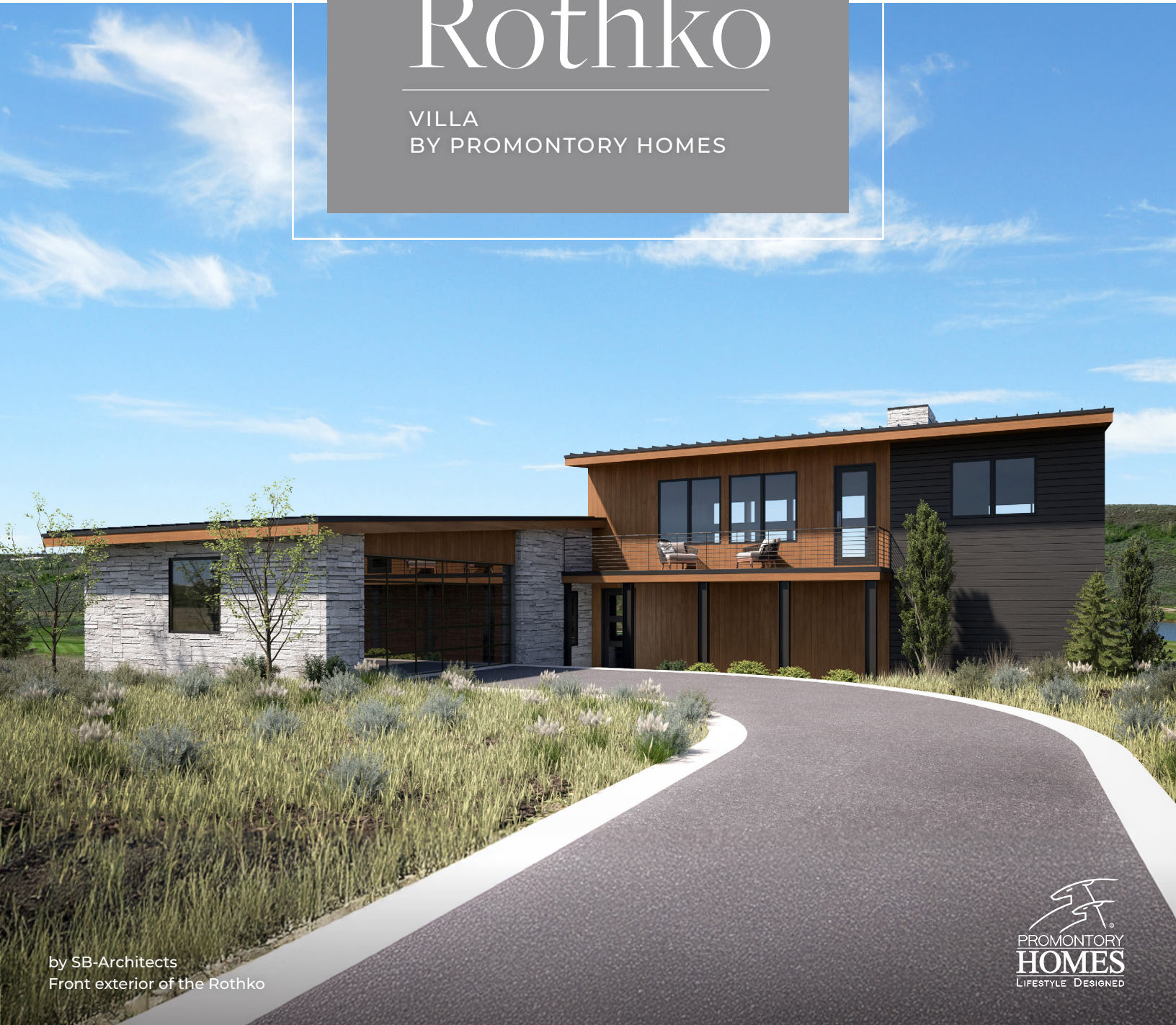
by SB-Architects Front exterior of the Rothko