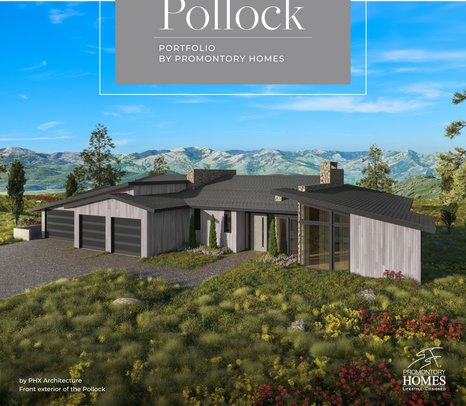
by PHX Architecture Front exterior of the Pollock