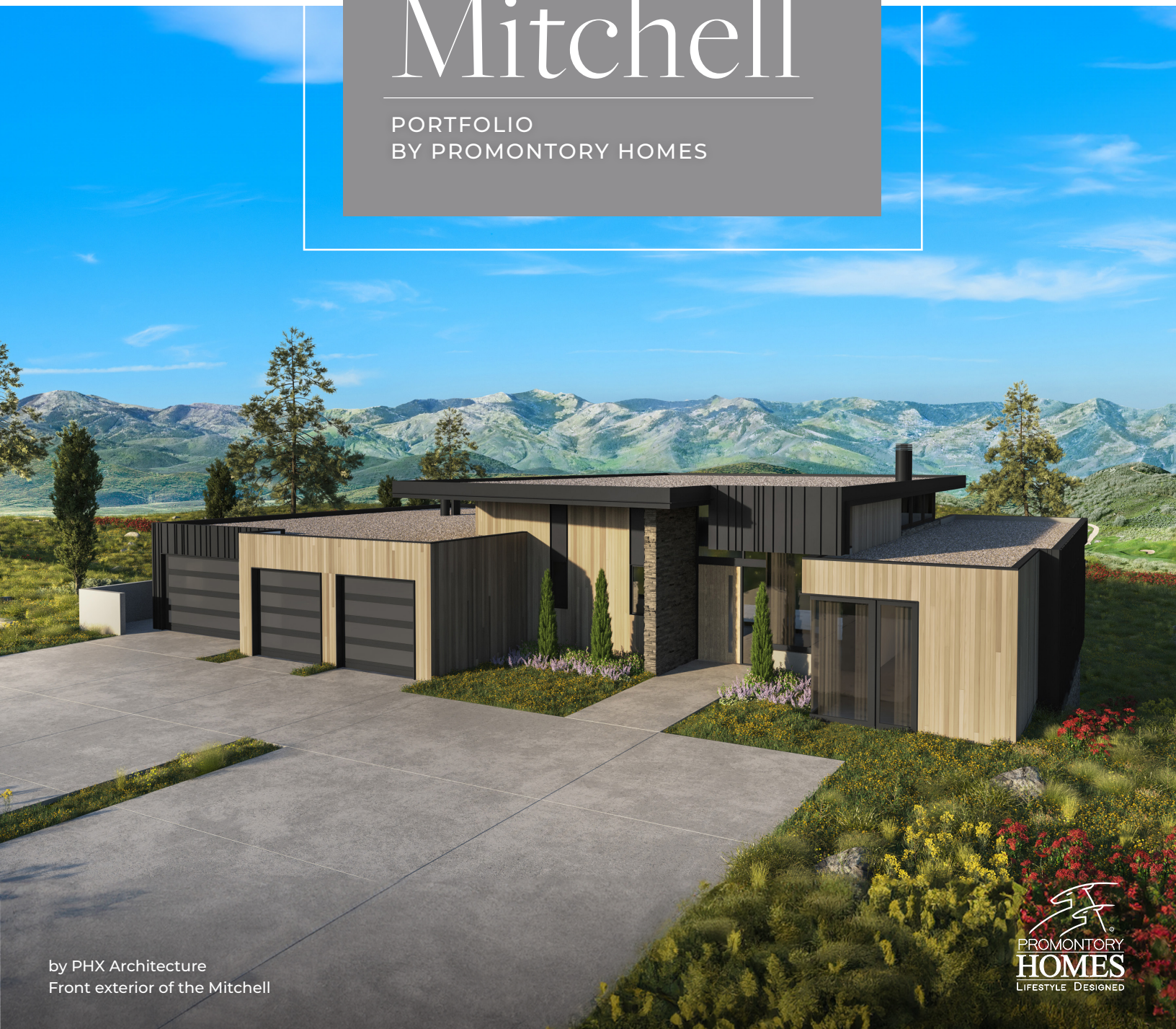
by PHX Architecture Front exterior of the Mitchell