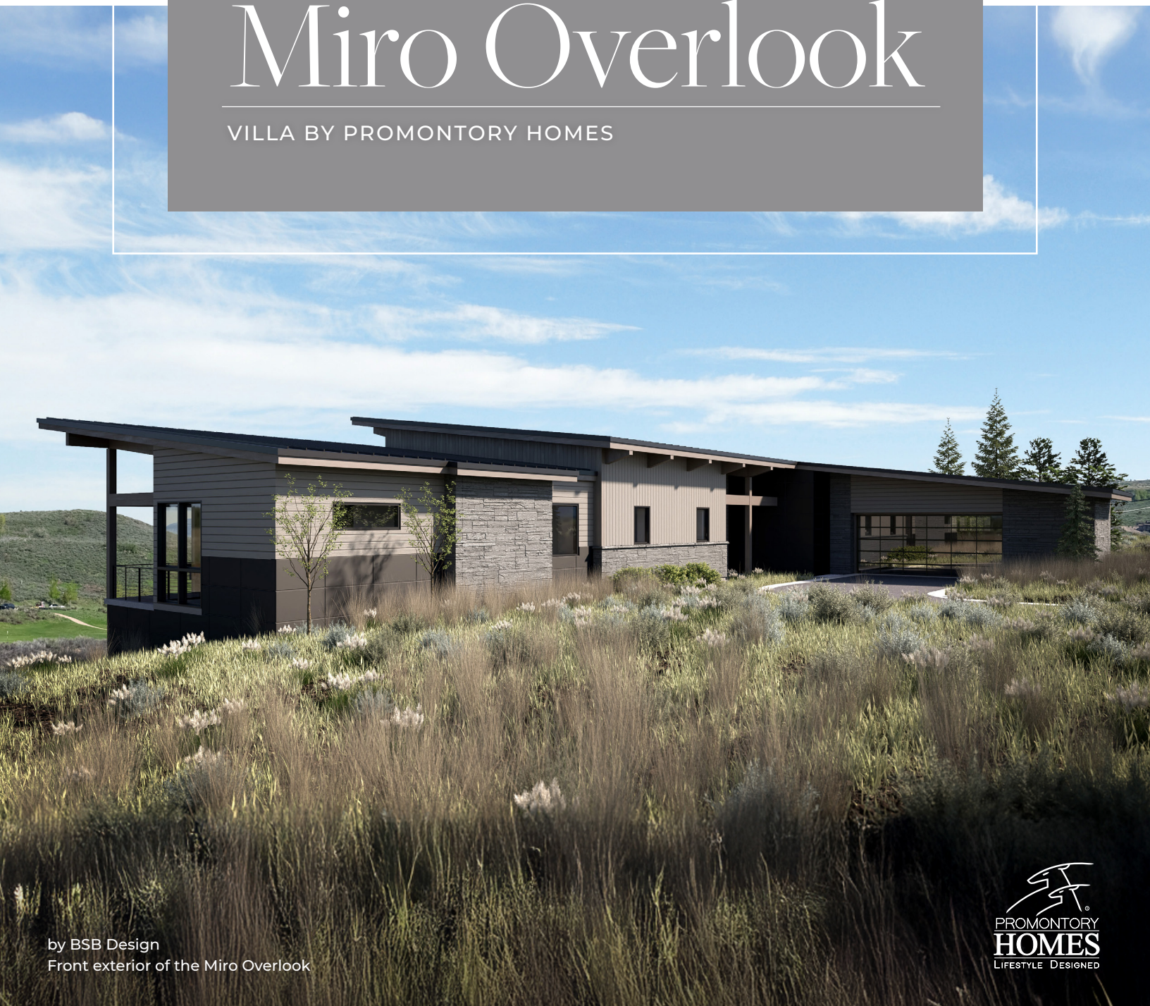
by BSB Design Front exterior of the Miro Overlook