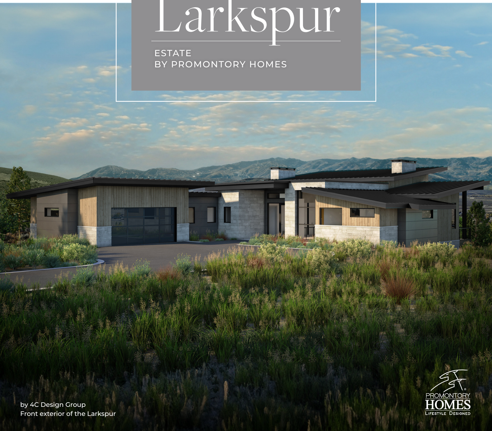
by 4C Design Group Front exterior of the Larkspur