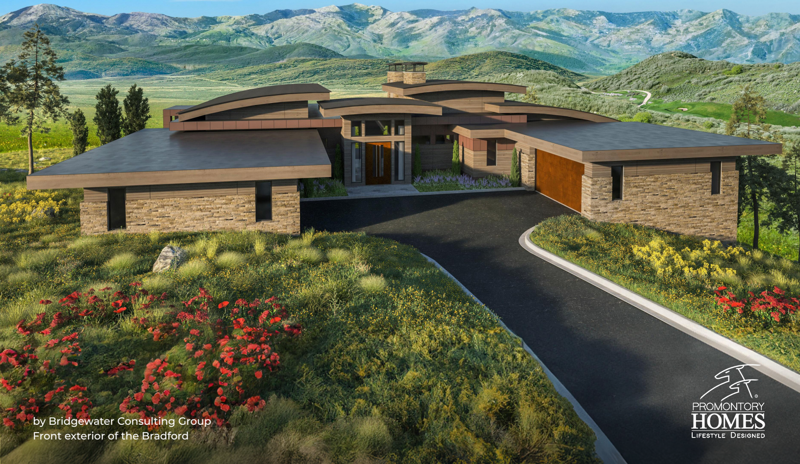
by Bridgewater Consulting Group Front exterior of the Bradford